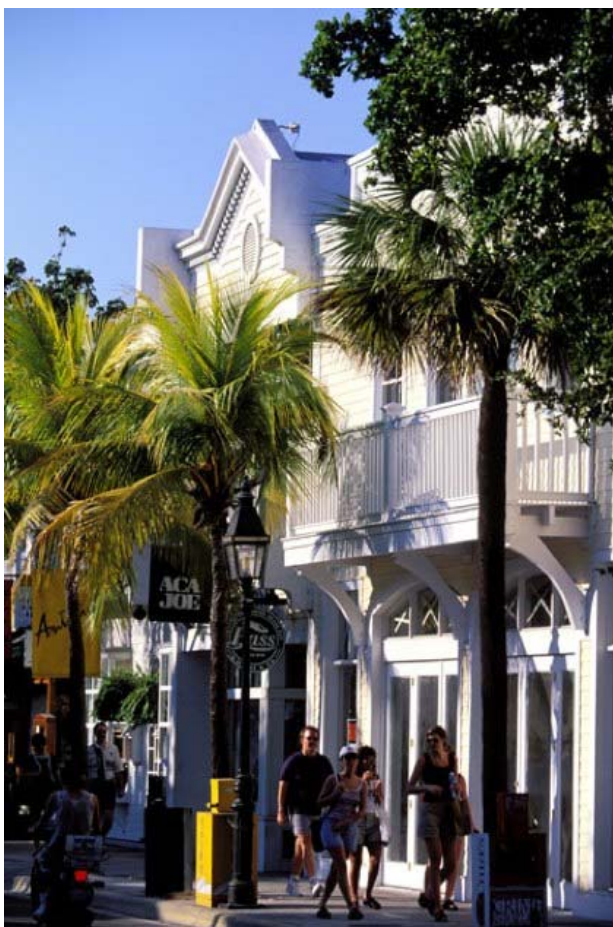
FLORIDA: Key West is the final dot on mainland America